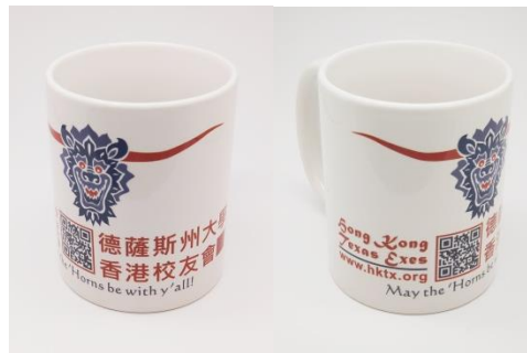
Coffee mug: HK$100

Write to us at hongkong@alumni.utexas.net if you are interested in the merchandise. The profit on the sale of our merchandise will help us in the running of the club.