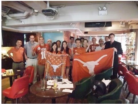
2009/11/10 Texas at OSU Viewing Party at Amici