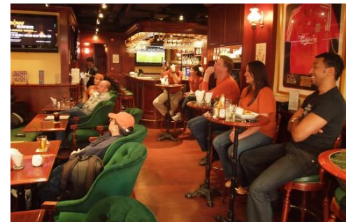
2008/11/28 Double-header football watching party at The Wheel

In October 2011 when I visited Texas Exes on campus, I found that they were supplying Texas football live feed to UKTE (United Kingdom Texas Exes) in London on a regular basis. We were offered to take the feeds that London did not need.