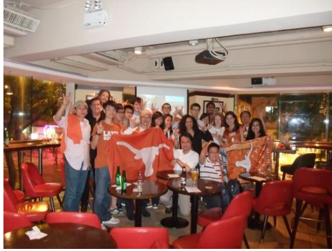
2009/10/17 Red River Rivalry Live Viewing Party at Amici

The 4 live watching parties in the 2009 season: