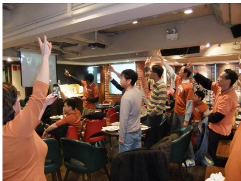
2010/01/08 National Championship Live Viewing Party at Amici