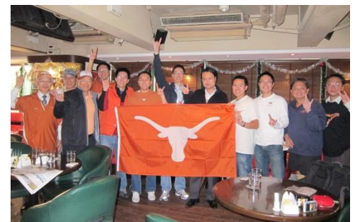
2011/12/29 Holiday Bowl Live Watching Party at Amici

Texas Tech game after the game ended and one alumnus accidentally knew about the score before coming to the party. The others were not that thrilled because although we did not know the score during the party but it was still history. So for the Baylor game, which we wanted to show right after it ended attracted very few people, despite it was equivalent to a conference championship game. That is why the Exco wants to have our own Slingbox at Texas Exes so that we can watch all the games that we want to watch. This year we want to bring as many games as possible to our alumni.