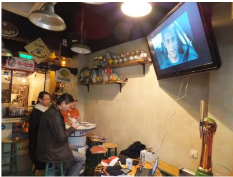
2012/12/30 Alamo Bowl Live Viewing Party at Ruggers: with an unlimited amount of food for breakfast on an ice-cold morning