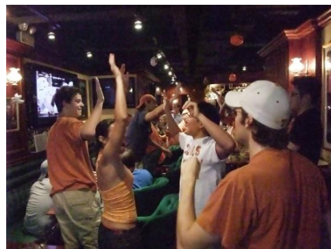
2008/11/2 Watching the Texas Tech game early in the morning at The Wheel

Andrew joined the Exco in 2010, so we had a "stable supply" of live game feeds. On October 3, 2010, we did the craziest thing! We asked our