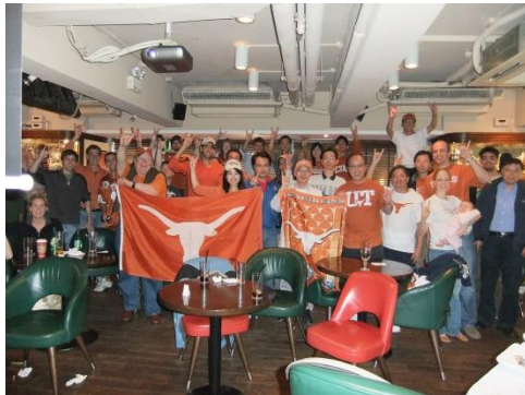
2009/12/06 Big 12 Championship Live Viewing Party at Amici