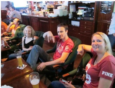
2011/10/09 ou alums at the Red River Rivalry Live Viewing Party at The Wheel

Due to time differences, we would be able to get the Saturday evening games and weekday games including Lonestar Showdown and Texas's bowl games. But despite this good news, we began to face another obstacle in organizing football watching parties. The economy was recovering, so bars and restaurants were not interested to serve us for games starting at 3:30am or 7:30am any more, while those willing required a very high minimum spending. One restaurant which is mentioned above asked for $300 per head and another also mentioned above said they would not open their restaurant for us in the morning unless we spend more than $10,000! So a few times we had small parties at our alumni's homes. That was not a good solution, though.