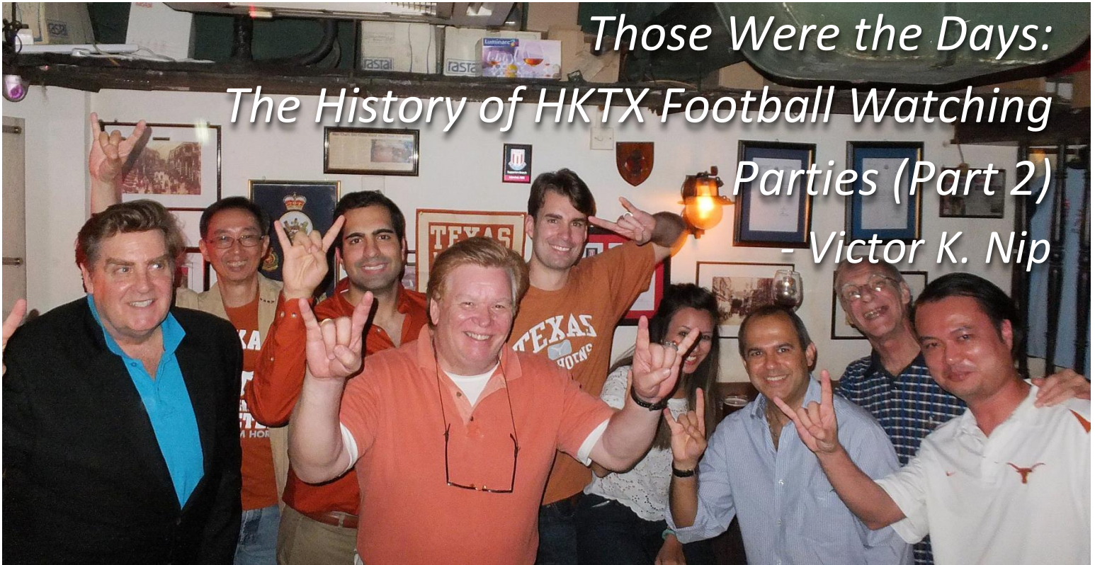
2013/10/5 Alumni watching the Red River Rivalry at Old China Hand