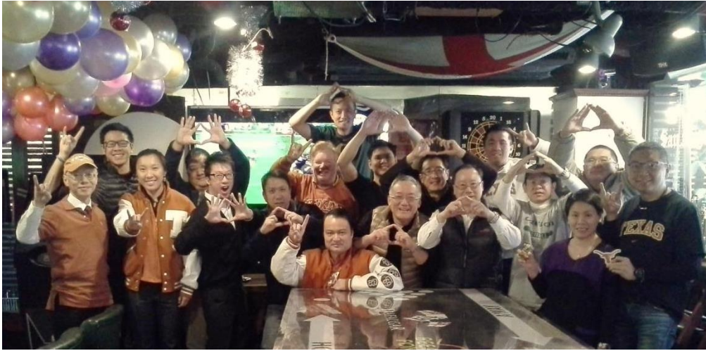
2013/12/31 Alamo Bowl Watching Party with the alumni of Oregon, second joint-club football watching party ever at Trafalgar