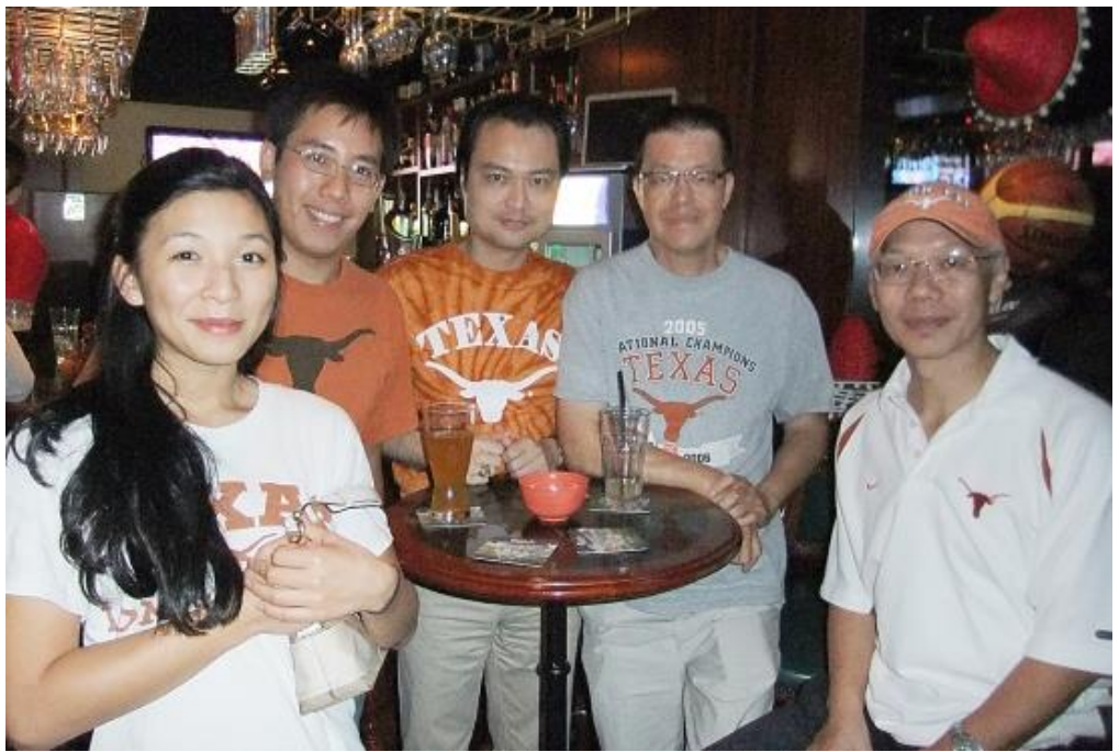
2010/10/03 Red River Rivalry Live Viewing Party at The Wheel