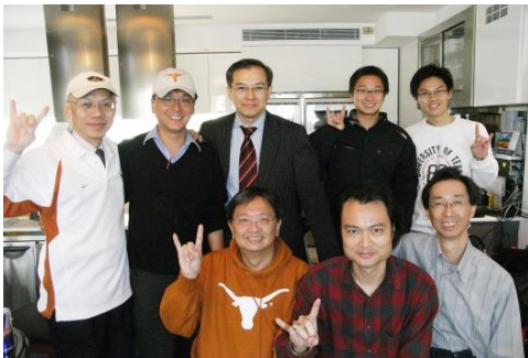
2007/12/28 Watching the Holiday Bowl against Arizona State at Hip Holiday

alumni to go to The Wheel to watch the ou game at 3:30am. Many alumni showed up despite it was supposed to be bed time.