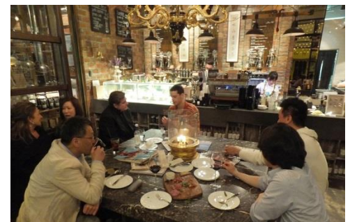
After the AGM, a few of us went to Academia for some drinks and chats.