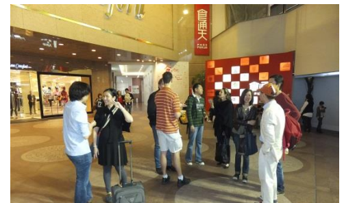
Call it a bad habit but this is what we always do! Some of our participants enjoyed each other's company so much that they find it hard to leave even when the event has ended, and chatted at the bottom of the building for quite some time.

To view the pictures of the event, go to hctx.org/nl0201 or scan the QR code at the end of the newsletter, and follow the links there.