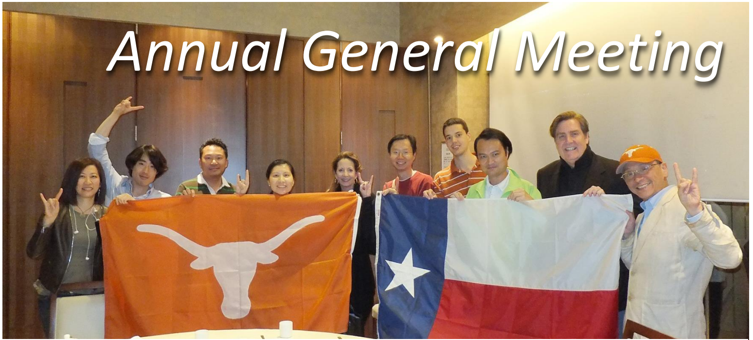
Those who stayed till the end of the dinner gathered for photo tradition of ours

Our Annual General Meeting was held on March 9. Last year we had the AGM in Modern China Restaurant in Times Square. We found the place matched our requirement so much that we decided to have the AGM in this place again.