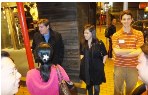
Participants who stayed for Texas Independence Day Dinner