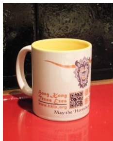
Coffee mug: HK$100

We have been auctioning off Longhorn merchandise for years to raise funds for our club. Our auctions create a win-win-win situation where our members get the Longhorn merchandise that they love, UT gets the normal profits on the sale, and HCTX earns the rest of the profits to subsidize other activities. Now, we have merchandise with our very own HCTX logo Ted (Texas Exes Dragon)! For this round, we have the following: