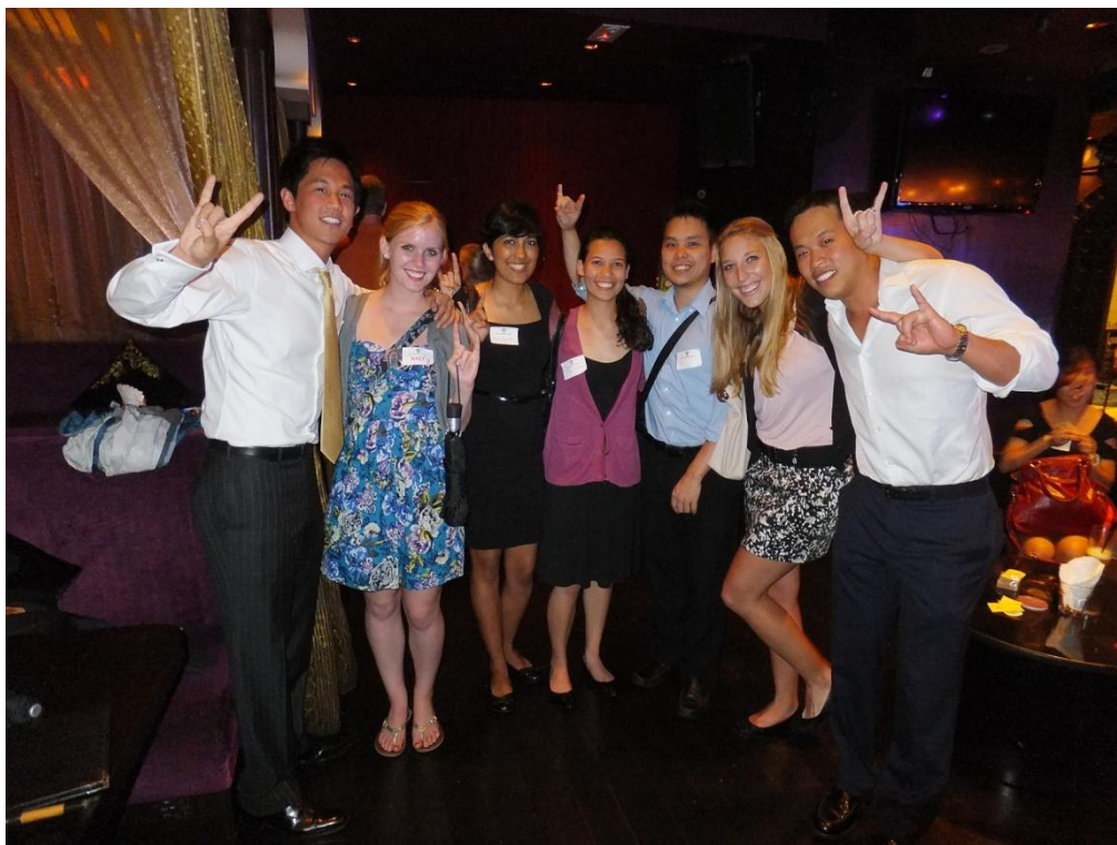
CIBER Summer Program students and alumni mixing together at the Happy Hour last June

This year, the same CIBER Summer Program groups (Accounting and Supply Chain Management) of 30 students each will come to Hong Kong in June. Our tentative plan is to have a welcoming dim sum lunch with the students and staff of the program on June 9 in Shatin, and to have a special happy hour gathering with them on June 29 in the Lan Kwai Fong area. We would like to invite you to join us and meet the students in these two events. More information will be available soon. Please mark down the dates in your calendar for now.