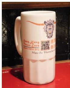
Beer mug: HK$150

Write to us at hongkong@alumni.utexas.net if you are interested in our merchandise. The small profit on the sale of our merchandise will help us in the running of the club.