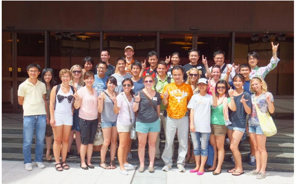
The CIBER group and alumni after the Dragon Boat Festival lunch last June

Each summer the Center for International Business Education and Research (CIBER) sends about 200 graduate and undergraduate business